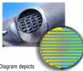
Diagram depicts exchanger cross section

Protected under U.S. Patent Nos. 6,186,223 and 6,244,333